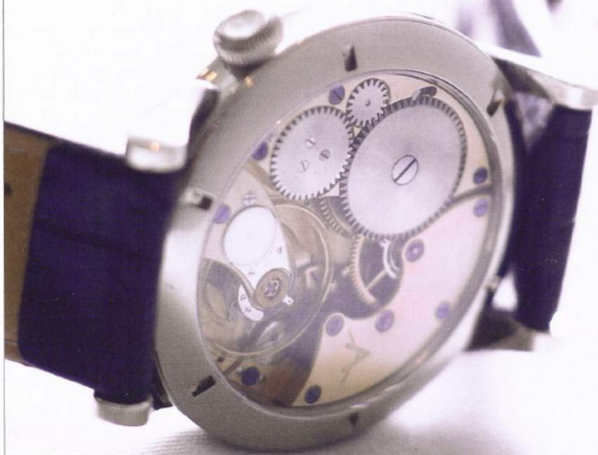
The VK30 has one of the biggest balance wheels we've ever seen in a wristwatch.