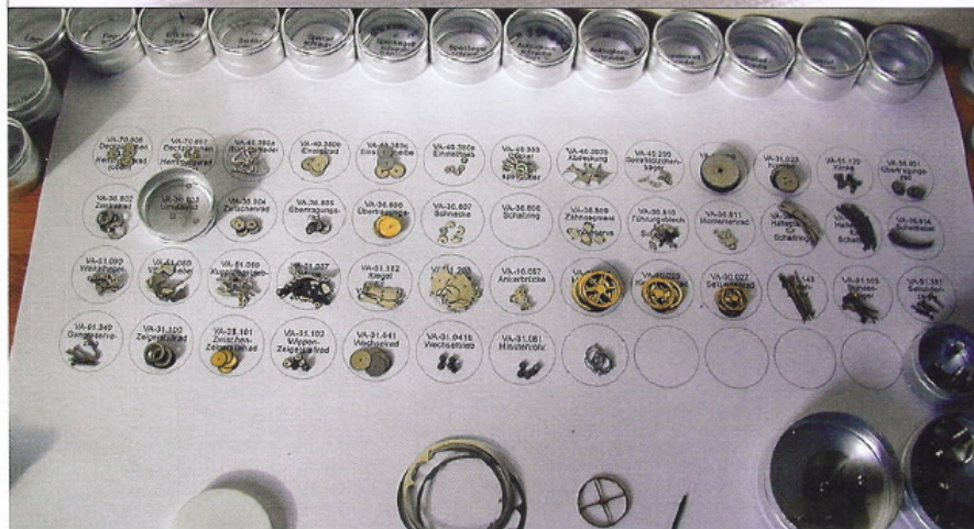
The varying components of Vyskocil's timepiece are all made by him!

How does Vyskocil's watch accomplish this fantastically pragmatic function? It is all thanks to a tiny ratchet wheel that has exactly 60 positions cut into it. As you move the seconds hand forward, the minute hand moves forward correspondingly, because of this ratchet wheel.